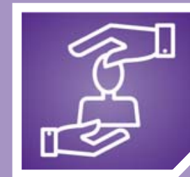
Landlord and Tenant Advice