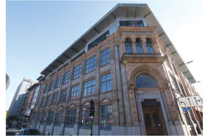
Dearing House, Sheffield