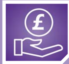
Service Charge Consultancy