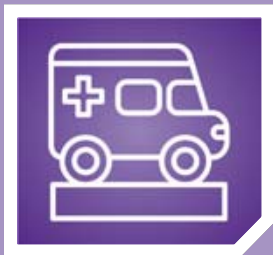
Health and Safety Compliance