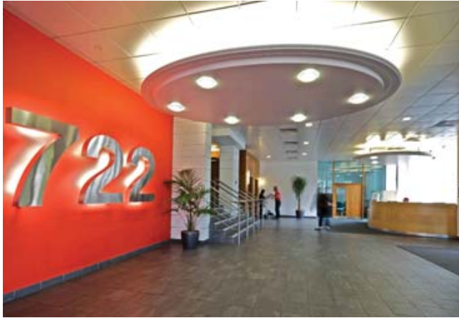
Prince of Wales Rd, Sheffield