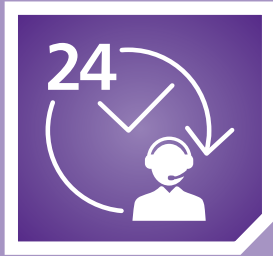
24 Hour Helpdesk

CPP are acknowledged specialists in Asset Management and Commercial Property Management. Our Property Management team provide a bespoke service to Property Owners enabling our clients to focus on their core business activity by managing their properties to their full potential and consistently maximising value. We are dedicated to adding value to our client's assets, as well as ensuring that Health and Safety risks are managed effectively to ensure a first-class service to occupational tenants.