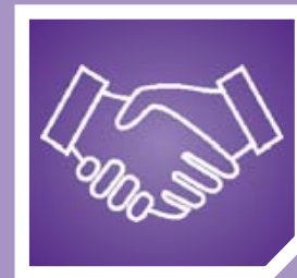
Rent Reviews and Lease Renewals