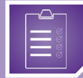
Break Clause Compliance Advice