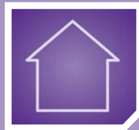
Vacant Property Management