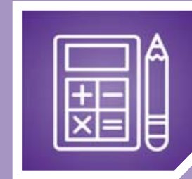
Financial Management and Service Charge Accounting