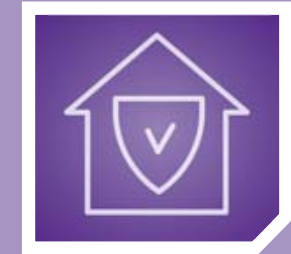
Interactive PPM and Maintenance Division