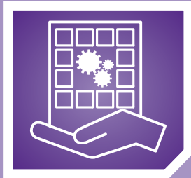
Service Charge Management