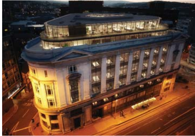
Steel City House, Sheffield