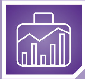
Portfolio Asset Management