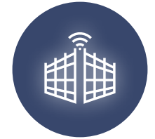
Remotely operated security gate for the service yard