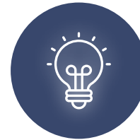
New LED lighting throughout

The main ground floor unit comprises a substantial manufacturing and warehousing facility extending to a total of 53,099 sq ft (GIA) including ground and first floor office accommodation. The unit has undergone substantial improvements in recent years and benefits from the following specification: