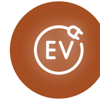
Separate staff car park with 6 EV spaces