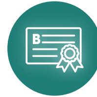
EPC 'B' rating