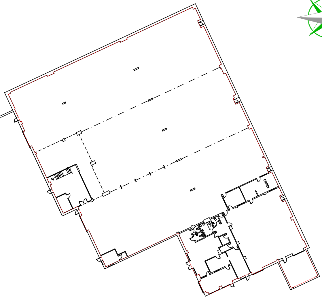
GROUND FLOOR PLAN 1:500 (2545 SQM)